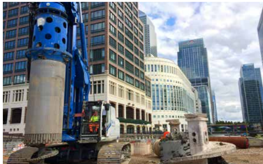
Rotary bored piling rig

Top down construction is used to speed up construction of multi-storey projects with deep basements. Plunge columns within piles are used to enable the construction of the building above ground level to commence at the same time as excavation for the basement, saving months off the construction period.