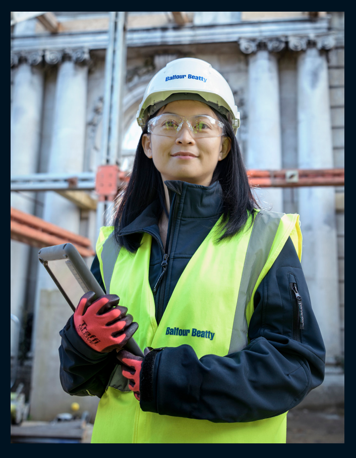
Digital technologies underpin successful project delivery

The COVID-19 pandemic has caused untold human suffering and demanded significant personal sacrifices. It has ravaged the global economy and had a profound impact on society. The construction and infrastructure industry has been left reeling, as have other sectors across the economy. Even where sites were able to remain open, new restrictions put in place to stem the spread of COVID-19 and keep our workforce safe, in addition to supply chain disruptions, have made them significantly less productive. This inevitably slows schemes down and adds cost. Work on other sites came to an abrupt standstill when they closed, resulting in cashflow problems for many firms. Bids and planning decisions have been delayed, which will lead to a hiatus in work in the medium-term. The sector has already been tested to the limit but, because the industry is closely linked to the strength of the economy but is post-cyclical, the full picture of COVID-19's impact on the sector may take some time to emerge.