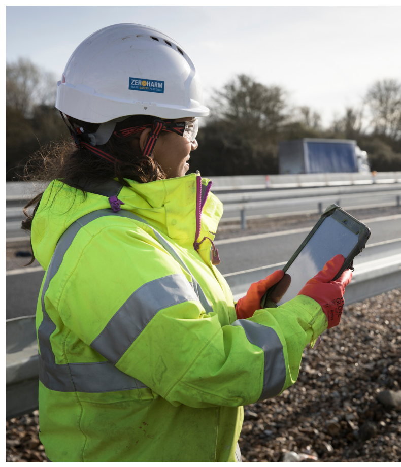
M4 Junction 3 – 12 Smart Motorway Programme

The COVID-19 crisis has had a significant impact on the construction and infrastructure industry. But it has also given us an opportunity to reflect. It will act as a burning platform to accelerate the rate of change in the sector in some key areas. We must take this chance to strengthen and streamline the sector to enable it to emerge, phoenix-like from the ashes of COVID-19.