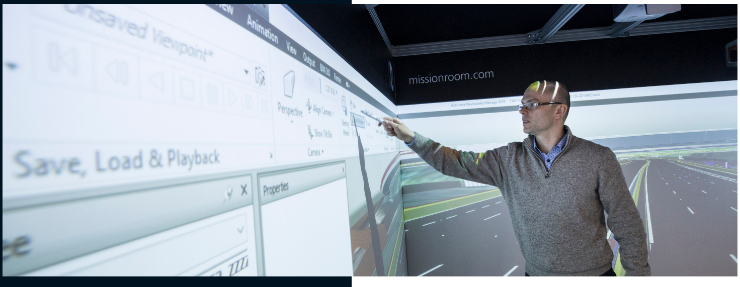
M4 Digital Innovation Hub

To help the industry address its skills shortages, there is potential to attract, retrain and deploy highly skilled engineers from other harder hit sectors which will experience a slower recovery, for example, the aviation and automotive industries. Given that many of these people will come from industries which are more advanced in terms of automation, this would play to the construction industry's need to modernise. However, capitalising on this will require some flexibility in terms of considering which skills are transferable and which areas will require some retraining. This could offer some of the people who are likely to be made redundant in those sectors the opportunity of a new, fulfilling career, while also meeting the construction and infrastructure industry's needs and helping to insulate the wider economy from some of the impacts of COVID-19.