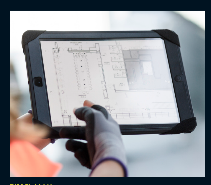
BIM Field 360

Moving beyond the immediate crisis, the sector will also play an important role in the recovery as the Government looks to fire up the economy. The construction and infrastructure industry is at the heart of the UK economy - an engine for skills and job creation nationwide and for exportable capability. It is investment in infrastructure that will help stimulate the economy after the pandemic, creating new jobs and driving the connectivity and growth that will reinvigorate local areas.