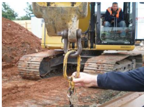
Figure 1. - Master link rotation restricted to approx. \pm 70^\circ