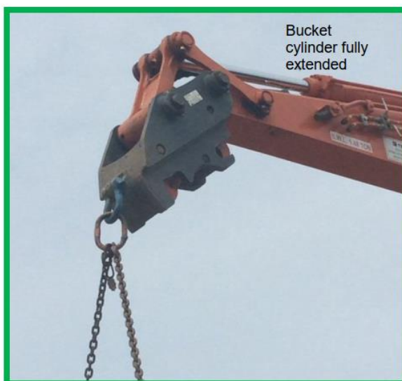
Figure 4. – Hitch tilted backwards with master link subject to twisting