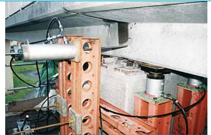
Temporary supports and hydraulic jacks in place prior to bearing removal

A combination of unwanted stress and reinforcement corrosion on the bearing shelf can severely compromise the integrity of the structure.