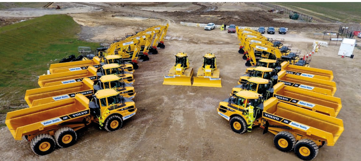
Balfour Beatty machinery

We value and embrace diversity and equality, putting them at the heart of what we do. We are proud that the gender balance of our team is almost equally balanced and that we continue to recognise the benefits of building a balanced and diverse team, addressing all aspects of diversity.