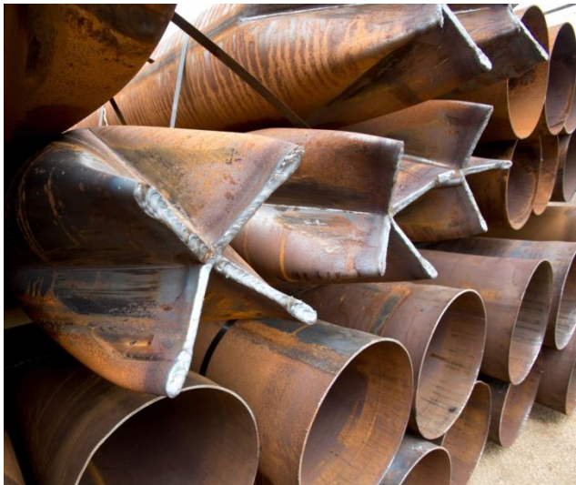
STEEL CASINGS WITH CRIMPED CLOSED ENDS