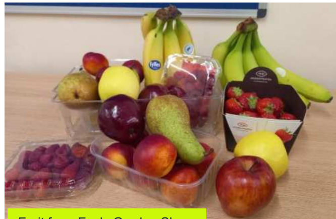
Fruit from Fox's Garden Shop

We are supporting our workforce, subcontractors, and visitors to make healthy choices on site with the addition of fresh fruit. Fruit and vegetables are part of a healthy, balanced diet and a great source of vitamins and minerals. Engaging with local businesses is also an important part of supporting the local community and we are pleased to be purchasing our fruit from Fox's Garden Shop. Fox's Garden Shop are a locally run business who are located on Yarm Back Lane, a key road within the project.