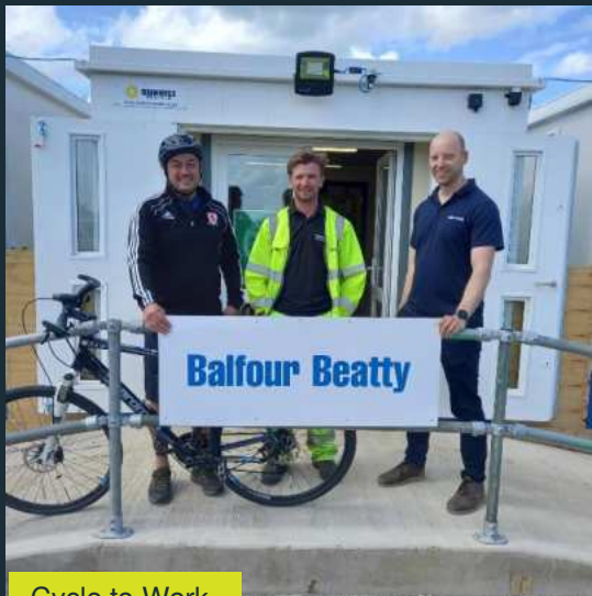
Cycle to Work