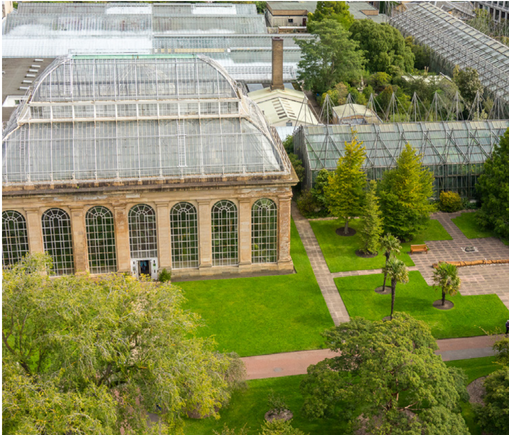
We're exploring lower carbon options and solutions on the Royal Botanic Garden Edinburgh – Biomes Initiative.