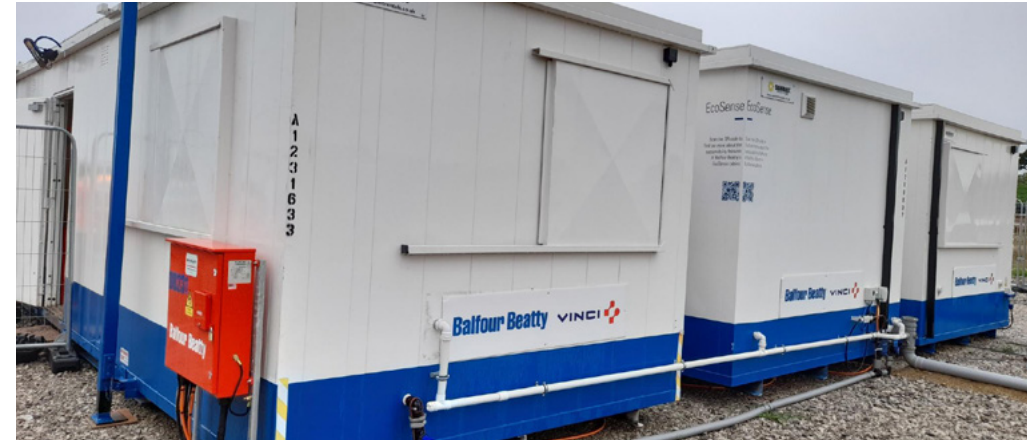
Our EcoSense cabins reduce carbon emissions on-site by up to 30%, and are one of a range of solutions that we're mandated.

Our EcoNet technology works by controlling and reducing the energy output from key appliances in cabins, such as those in kitchens, drying rooms and office spaces. Scan the QR code and watch our video to find out more.