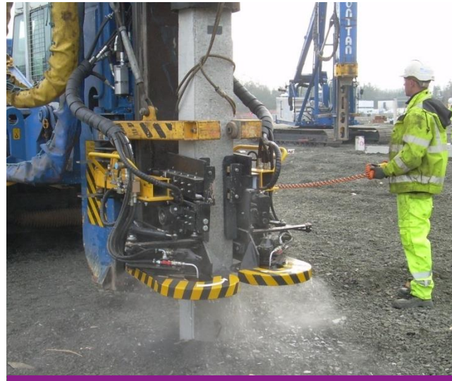
PILE CUTTER WORKING AT GRANGEMOUTH