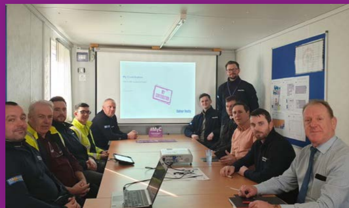
Meetings include My Contribution updates