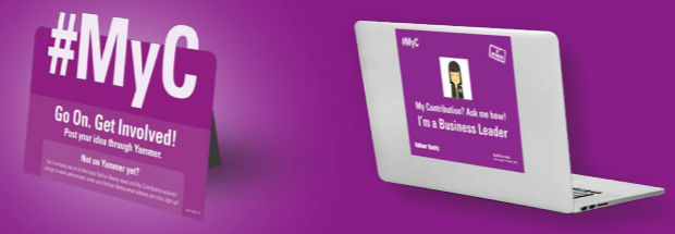
My Contribution is promoted everywhere