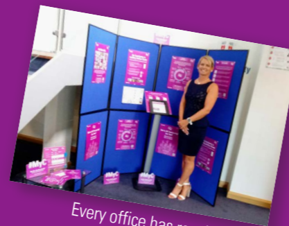
Every office has received MyC support materials