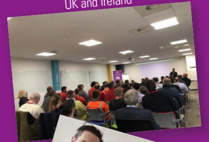
MyC is launched across Balfour Beatty UK and Ireland