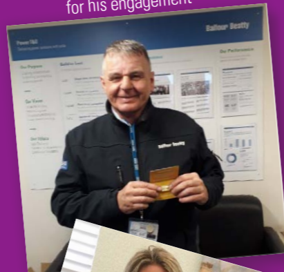
An employee receives a Gold Award for his engagement

A further achievement of My Contribution is how employees are able to collaborate with colleagues they would not usually work with, in different functions or geographical locations – often physically seeing the difference that this knowledge sharing and collaboration is making to our business, every day.