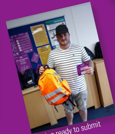
Getting ready to submit a card entry