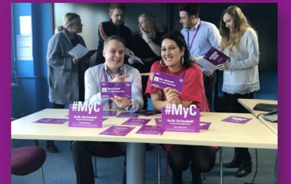
Every employee can get involved, wherever they work

Every day My Contribution is 100% results focussed. Open dashboards are shared across the business providing the ability to drill down to function, business unit and project level, showing the number of ideas raised and progressed, with statistics on the actual results and benefits that have been delivered.