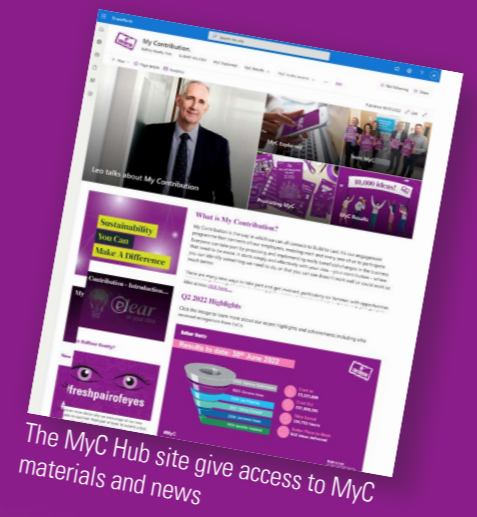
The MyC Hub site give access to MyC materials and news