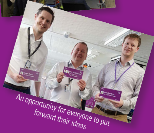
An opportunity for everyone to put forward their ideas