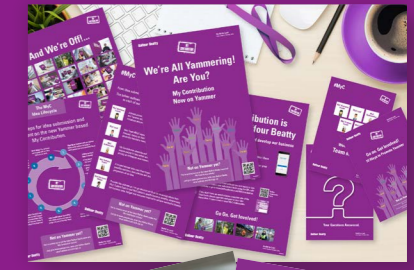
Changing the company for the better

These ideas drive change, making the business more efficient, safer and ultimately a better place to work.