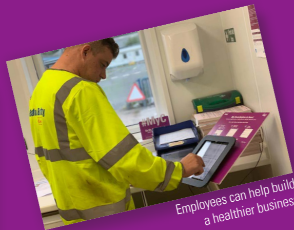
Employees can help build a healthier business

"Your ideas can help change our company"