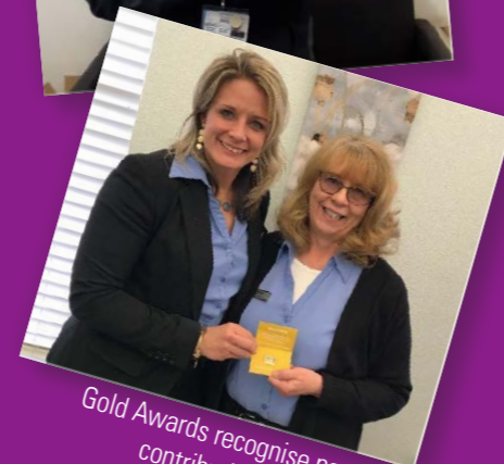
Gold Awards recognise particular contribution achievements