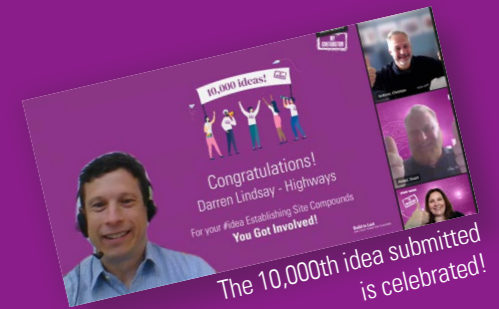
The 10,000th idea submitted is celebrated!