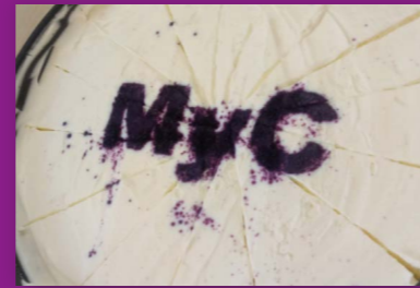
A MyC Cake promotes engagement!

Inclusive engagement is critical, so for employees based on construction sites who do not have digital identities, idea cards are provided whilst project site digital solutions for these sites are being trialled.