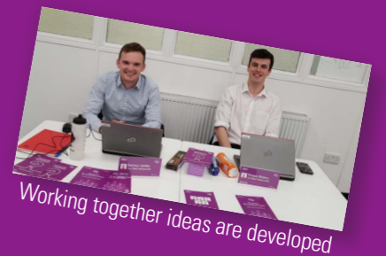
Working together ideas are developed