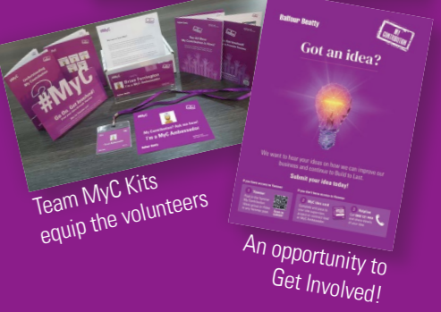
Team MyC Kits equip the volunteers