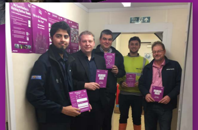
People working together are building Balfour Beatty