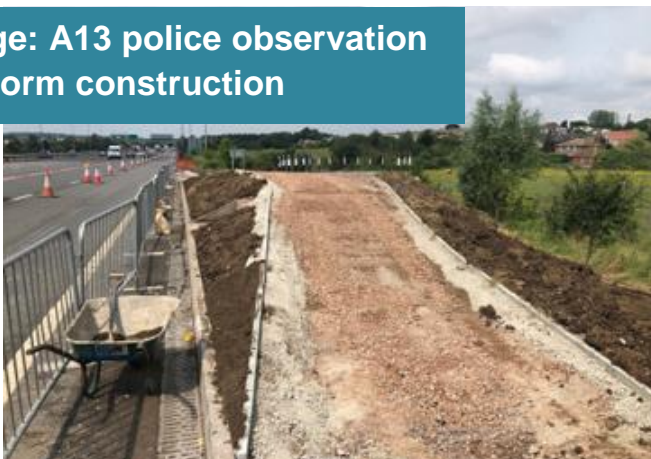
Image: A13 police observation platform construction