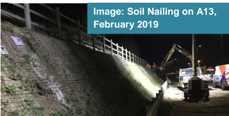
Image: Soil Nailing on A13, February 2019