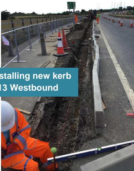
Image: Installing new kerb line on A13 Westbound