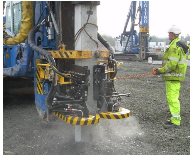
PILE CUTTER WORKING AT GRANGEMOUTH