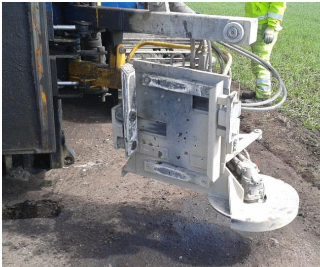
PREPARING TO USE THE PILE CUTTER